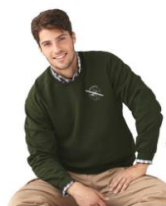
Product ID: A312-237-3942 Digitally Printed Gildan Ringpun Crew Sweatshirt