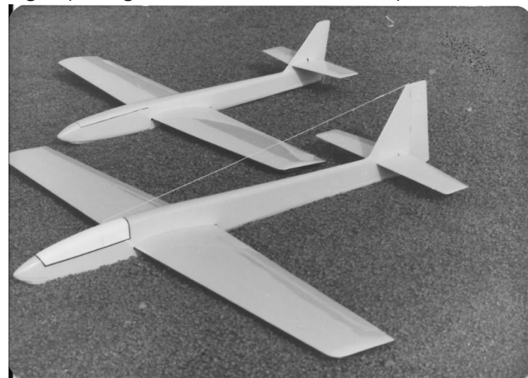
Two slope gliders of the 1970s – Ken Banks' Pterodactyl in the foreground and a "Swallow" in the background. Both of these were popular with slopers especially for high wind days. The wings were foam core with balsa sheeting, and the Pterodactyl had rudder, elevator, and ailerons for control.

Ken then designed and built a very fast aerobatic ship called the Pterodactyl. The Pterodactyl was purpose built for those high wind days at Torrey when beach runs are particularly fun. On those days when there would be no beachgoers, he would dive down low enough to clearly see the shadow of the plane on the beach, then climb all the way back up to cliff level and do it over again. Lots of fun. In those sorts of high wind days Ken would sometimes fly with a motorcycle helmet on, to avoid tearing in his eyes from the wind and sand being blown up from the beach below. He bridged the split between older TPG members and younger high-school aged pilots. For instance, Ken is one of those who taught youngster Steve Neu how to fly RC at Torrey.