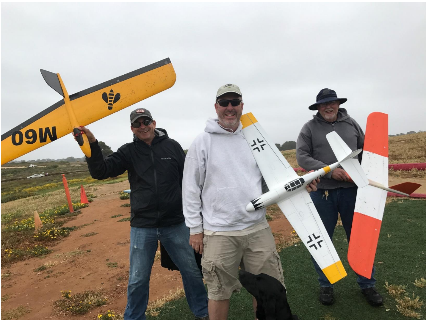
Very happy slopers!