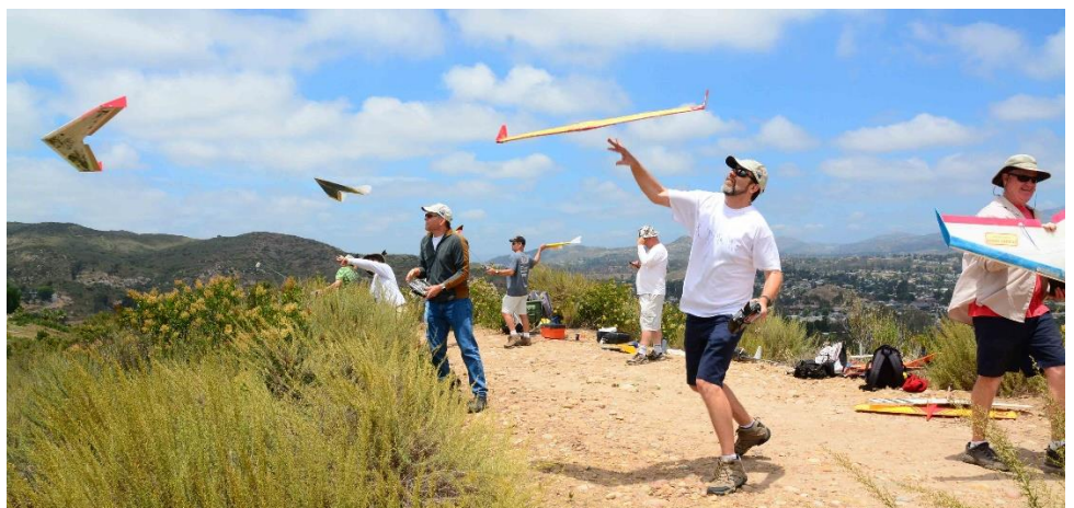
Beautiful day at Poway Slope. The only thing missing was wind.