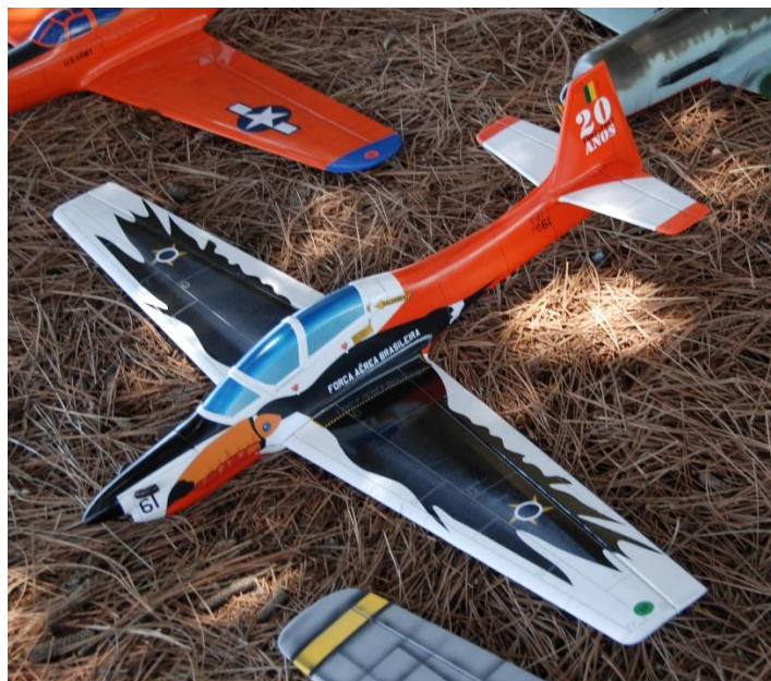
Greg's prize-winning Super Tucano at this year's PSSFest