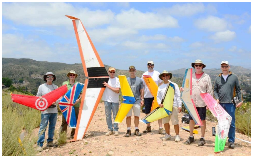
Quiz: Which plane is not like the others?

The Combat contest was called and the secondary date is July 8, but there is a good chance the date will change to the last Saturday in July (29 th ).