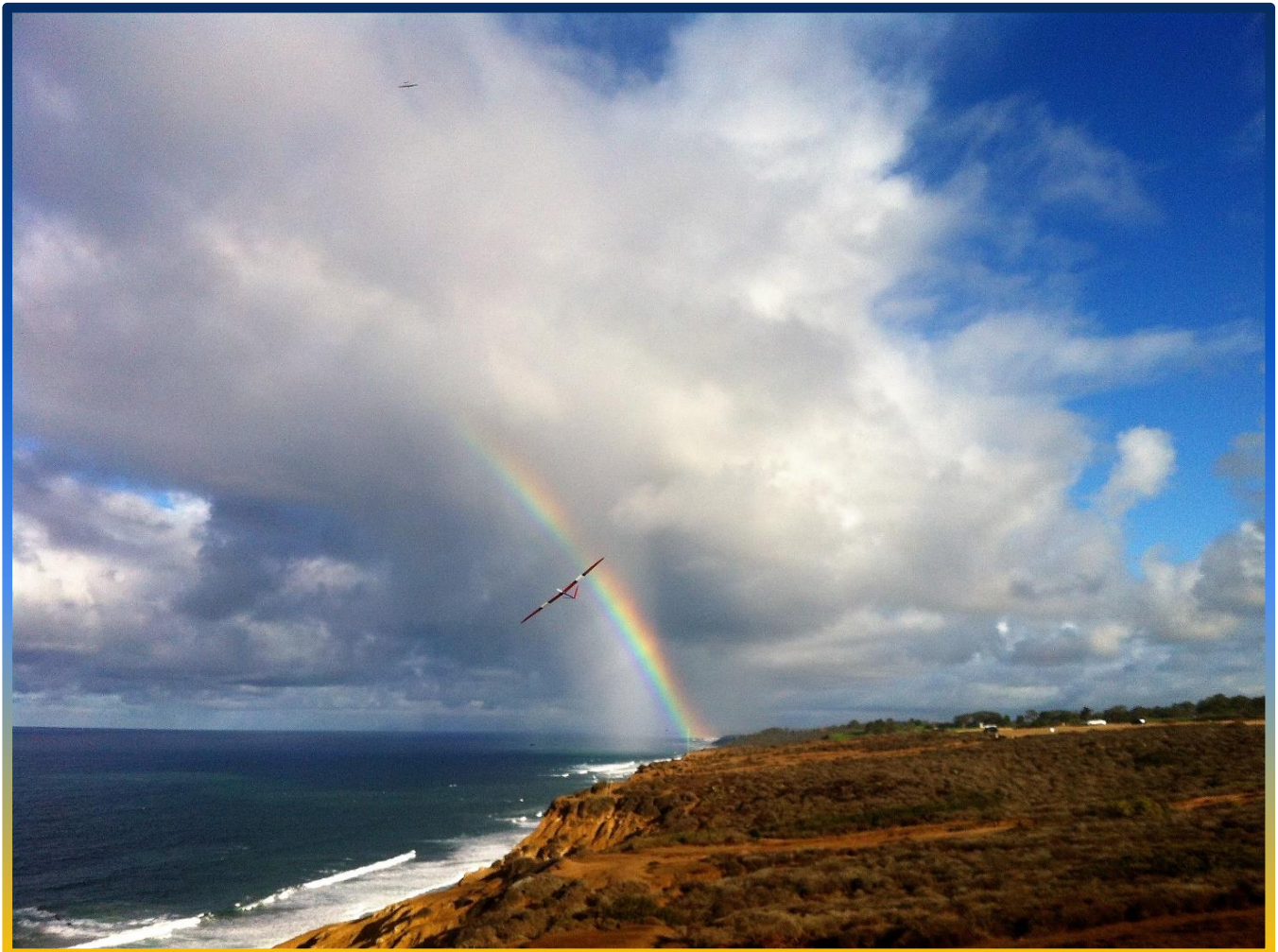
January Winner – Torrey rainbow