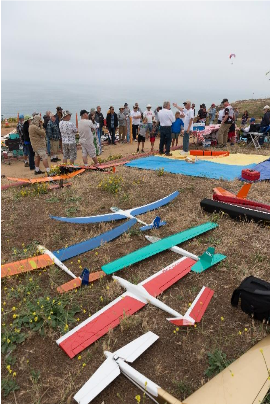
There were several Bob Martin models and of course, Hobie Hawks