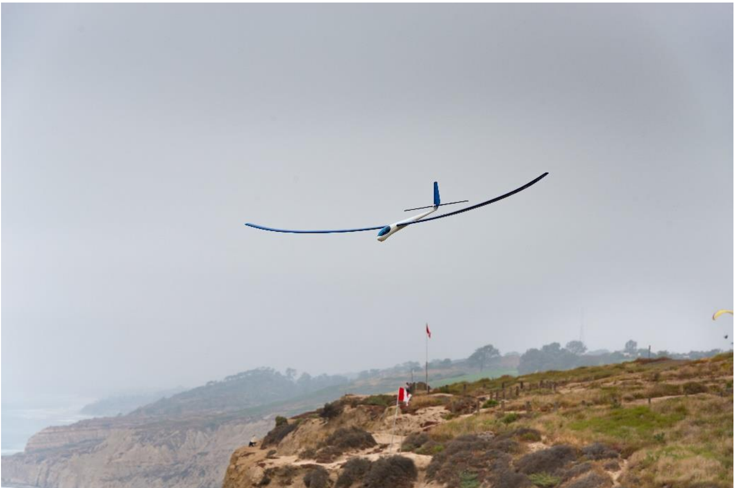
One of the Hawks over Torrey