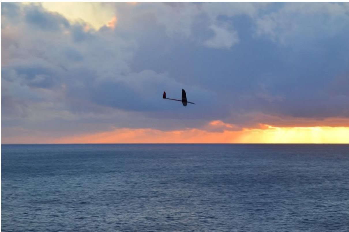
NAN Shadow at Torrey