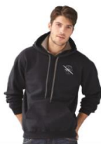
Product ID: A382-537-7660 Digitally Printed Gildan Hooded Sweatshirt