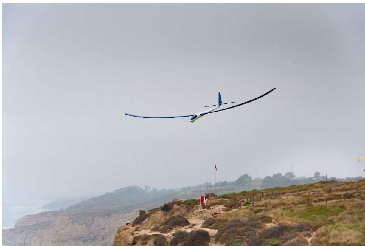
Hawk over Torrey